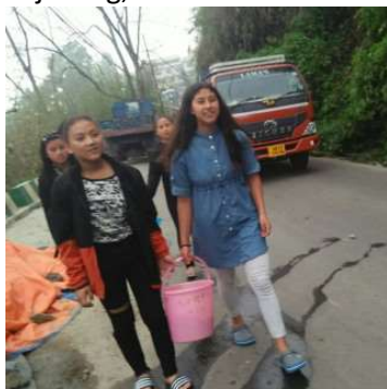
Before: on a busy road to the washing point in the village

An amount of € 6.800 has also been paid out of our reserves to the Central Tibetan School in Kalimpong (near Darjeeling, in the north-eastern part of India).