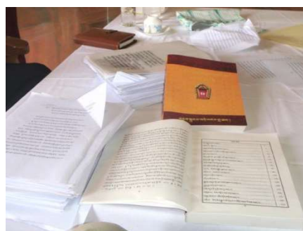
Loose sheets are turned into a well-printed book

Many books of old and valuable texts were lost in Tibet. At the Drepung Loseling Monastery these texts are being reconstituted piece by piece and reprinted, so that they will be available to future generations. This is an enormous task which the monks are tackling enthusiastically. They have drawn up a list of 26 such books. The cost of the reconstituting and printing 1000 copies of each book is € 2.300. We think it important that old texts be preserved and would like to aim at funding the costs of one of such books. Will you help? This can be partly done with the revenue of our internet book sales. Our website lists all the books for sale, including interesting books on Buddhism! Have a look at http://hetgoededoel.boekwinkeltje.nl .