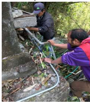
Then: the school is being connected to the water supply