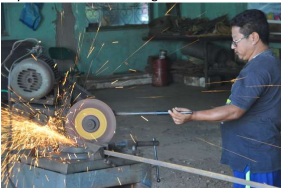
Dangerous working conditions and many accidents

I soon visited the Cooperative workshop to see how things were developing there. The bridge of the auto repair workshop had been improved, which makes it easier to work. Two young workers had been employed, one of whom is being trained as a welder, and the other has obtained a driver's license and is distributing filtered water in a small van. They do their work with big smiles on their faces.