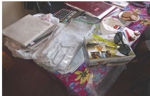
Protective equipment for working more safely

My attention was drawn to the unsafe way of working. This really shocked me. Welding was done with inadequate protection of eyes and hands, various machines were used without any safety measures, and nobody wore protective overalls or gloves. This created a high risk of accidents and needed immediate attention. I asked them to go to the nearest shop to buy safety equipment such as gloves, safety goggles, welding shields and protective aprons. For the modest sum of € 45 they now all walk about proudly in their protective gear, and there will surely be fewer accidents. Isn't that nice?