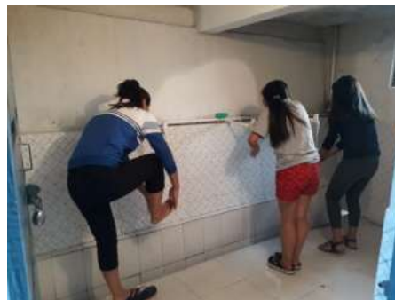
Now: splashing about in a safe place on the school premises

Till recently, the school was managed by the Indian government and had been totally neglected. Now the Tibetan Administration has been put in charge of managing the school, and this means tackling a lot of neglected maintenance. At this school there was only a water provision to the kitchen and this was delivered in water tanks. Kilometers away there is a little stream where the children were expected to wash themselves. The older girls would go there in the dark so that they had a bit of privacy. This was doubly dangerous for an already vulnerable group in India. Together with a French organisation we provided the money to set up a water line to the school. This has already been done and we received photos of happy children washing themselves at taps. What an improvement! But of course this has made a big hole in our reserves. Will you help us to build up our reserves again?